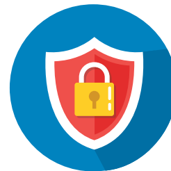
Option 1 Secure Payment Gateway

Decades ago, we solved the payments needs of the original omni-channel industry – chain hotels and megaresorts – from front desk and reservations to restaurants and retail boutiques – all with one comprehensive payment solution. With our know-how and new payment solution, we'll do the same for your entire enterprise.